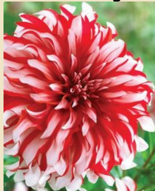
Dahlia 'Santa Claus'

Bulbs of hardy lilies, including the Orienpets (also called tree lilies) which I wrote about in the newsletter two weeks ago, are also in.