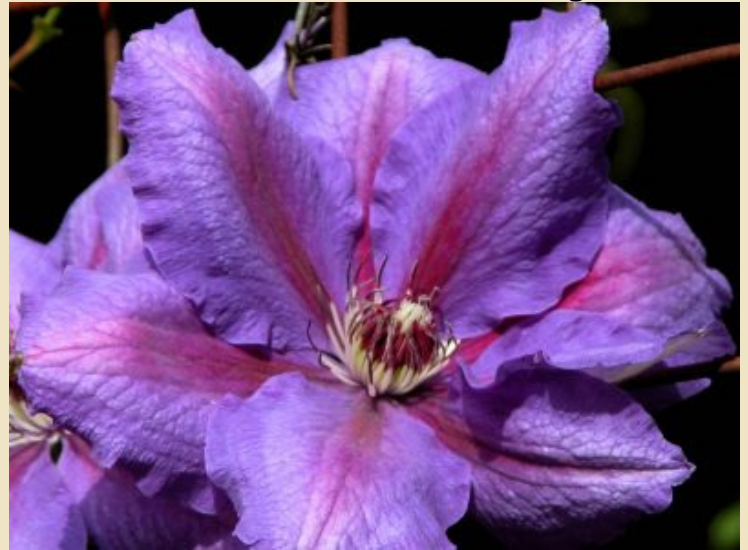
Clematis 'Vancouver Danielle'