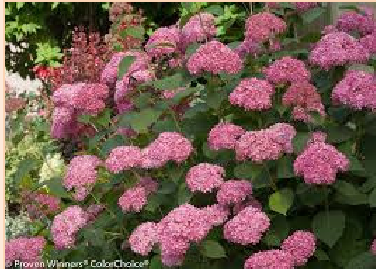
Hydrangea arborescens 'Invincibelle Spirit 11'

This is what Proven Winners has to say about their new 'Invincibelle Spirit 11'