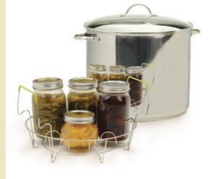
RSVP STAINLESS STEEL 20QT. CANNER/STOCK POT

Stick a clove in each crabapple. Cook up syrup of other ingredients and drop apples into it. Cover tightly, set into a 350° oven and bake until apples are tender. Put into sterilized jars and seal hot.