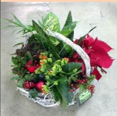
Large basket planter

JUST IN: gorgeous indoor table-top planters in several sizes priced from 18.99 for the small size, 22.99 for the medium size, and 26.99 for the large size. We also have fresh table centerpieces complete with two red taper candles at just 22.99 ea.