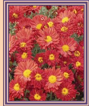
Mammoth Red Daisy *

(*Unfortunately the Mammoth Red Daisy was not available as a plug so I had to order it from a supplier in a 1 gallon potted format. It retails at 14.25 ea. but will be 40% off which makes it 8.55 ea.)