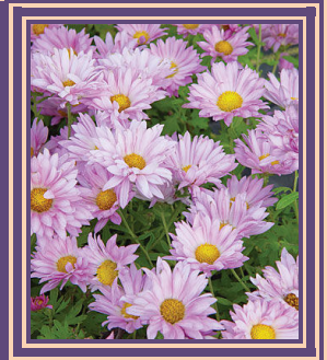
Mammoth Lavender Daisy @ 5.00 ea.