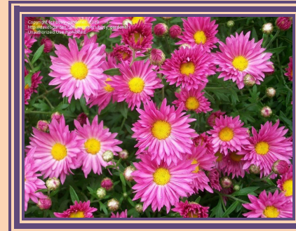
Mammoth Dk. Pink Daisy 15cm pot @ 5.00 ea.

are a meter tall, making a mound more than a meter wide. With a remarkably dense, tight growth habit, each plant is covered with hundreds of colourful daisies. The plant doesn't need pinching, pruning or deadheading to maintain its mounded, dense form. These are the varieties we have in stock: